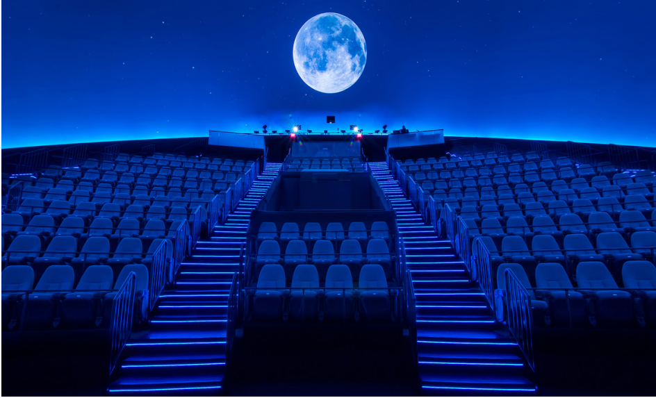
▲ The world's first 8K digital full-dome system installed as a 1570 film replacement in a dome