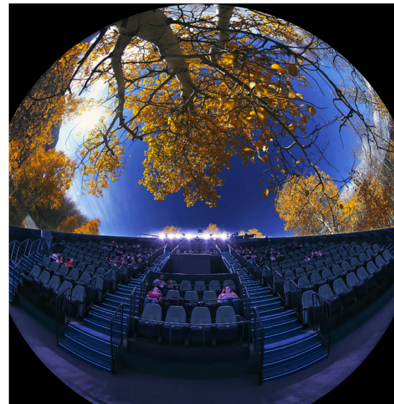
▲ A fish-eye view of the Richmond Theater at the Science Museum of Virginia

Contact us today to find out how your organization can benefit from Christie solutions.